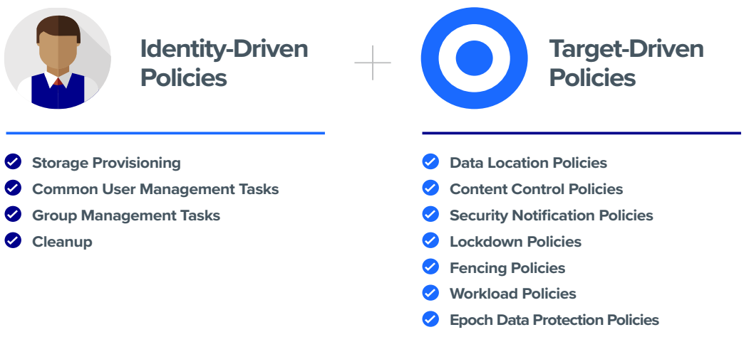
Figure 1. File Dynamics manages network-stored data using both Identity-Driven and Target-Driven policies.